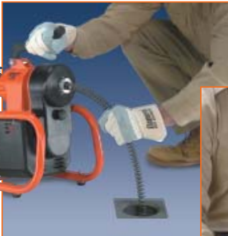
Clear 4" lines up to 150 feet long with 7/8" x 15' sections...