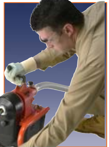
or clear 2" – 3" lines up to 125 feet long with 5/8" x 7-1/2' sections.