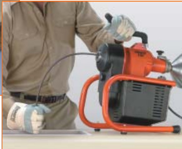
or clear 1-1/2" – 2" lines with 5/16" x 25' cable ...