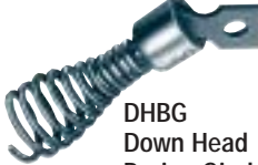
DHBG Down Head Boring Gimlet