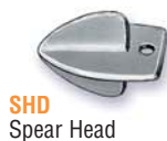
SHD Spear Head