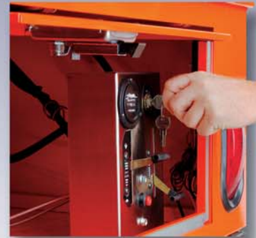
Remote control panel protected inside locked toolbox.

A 24 hp Honda engine with electric start powers the 2500 psi, 12 gpm pump with Vibrapulse® through a 2 to 1 V-belt reducer. Two hose reels – a jet hose reel with 400 ft. x 1/2" capacity featuring electric variable speed rewind, and a supply hose reel carrying 150 ft. x 3/4" hose – are mounted at the rear of the unit next to the pressure gauge and output valve. Engine controls, including an hour meter, are mounted within easy reach in the lockable tool box with slide action doors just below the reels.