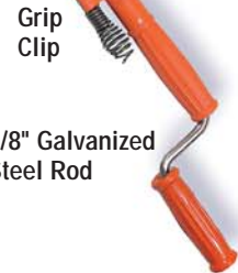
3/8" Galvanized Steel Rod