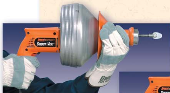
1 Slide Grip Shield Forward to release cable.