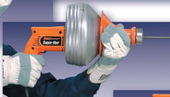
2 Pull cable out of drum. 3 Slide Shield Back to grip cable.