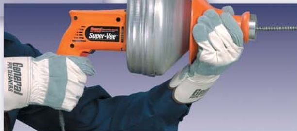
4 Run cable into line and repeat. It's that quick!