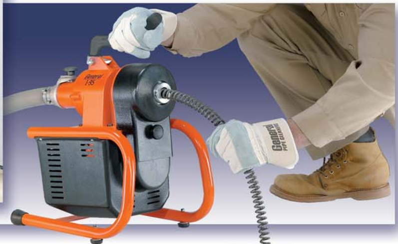
Clear 2" – 3" lines up to 125 feet long with 5/8" x 7-1/2' sections or 4" lines up to 150 feet long with 7/8" x 15' sections.