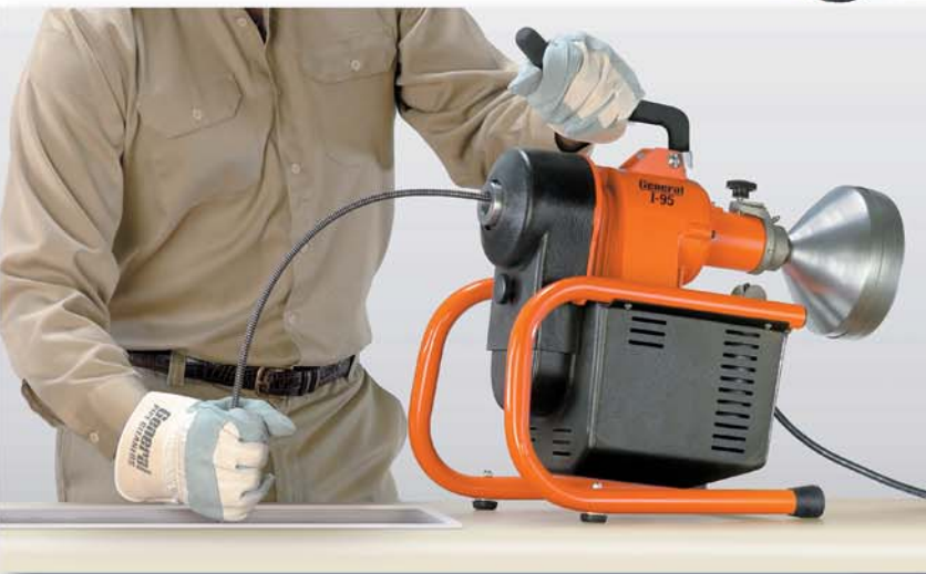
Clear 1-1/2" – 2" lines with 5/16" x 25' cable.