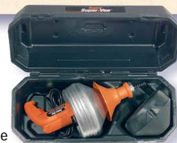
MCC Carrying Case For Super-Vee, Power-Vee and Handylectric.