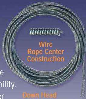
Wire Rope Center Construction