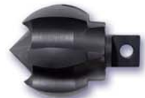
2CG and 2-1/2CG Clog Chopper Clears debris, scale, and crystallized urine. For 1/2", 5/8" and 3/4" cables.