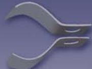
1-1/4" SCB 1-1/4" Side Cutter Blades For cutting and scraping. For 5/16" and 3/8" cable.