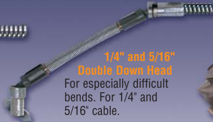
1/4" and 5/16" Double Down Head For especially difficult bends. For 1/4" and 5/16" cable.