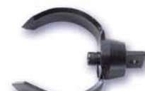
HDSC Heavy Duty Side Cutters In 3" and 4" sizes.