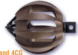
3CG and 4CG Clog Chopper Maneuverable cutter clears roots, debris, and scale. Available with connector to match General or other brands.