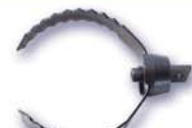
UC 2", 3", and 4" U-Cutters For cutting and scraping.