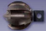
1CG and 1-1/2CG Clog Chopper Clears debris, scale, and crystallized urine. For 5/16" and 3/8" cable.