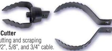
2" U-Cutter For cutting and scraping. For 1/2", 5/8", and 3/4" cable.