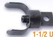
1-1/2" U-Cutter For cutting and scraping. For 3/8" and 1/2" cable.