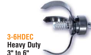
3-6HDEC Heavy Duty 3" to 6" Expansion Cutter Can pass through 3" pipe to reach and clean 6" pipe. Can be put through 4" "P" traps.