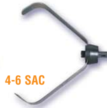
4-6 SAC Self Adjusting 4" to 6" Side Cutter Blades Can pass through 4" pipe to reach and clean 6" pipe.