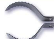
SCB Side Cutter Blades For cutting and scraping. Furnished in 3" and 4" sizes.